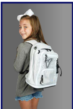
CheerVille Rebel Mini Dream Bag (optional)

These items are in the ProShop online at cheervilleproshop.com .