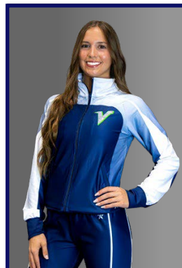
CheerVille Warm Up (optional)