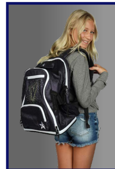
CheerVille Rebel Navy Dream Bag (optional)