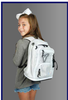
CheerVille Rebel Mini Dream Bag (optional)

These items are in the ProShop online at cheervilleproshop.com .