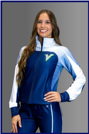
CheerVille Warm Up (optional)

These items are in the ProShop online at www.CheerVille.com .