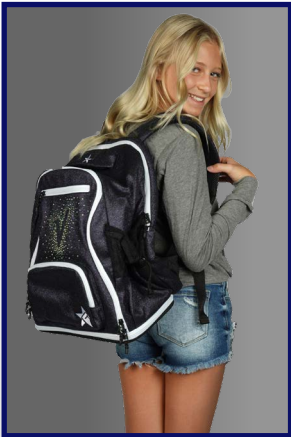
CheerVille Rebel Navy Dream Bag (optional)